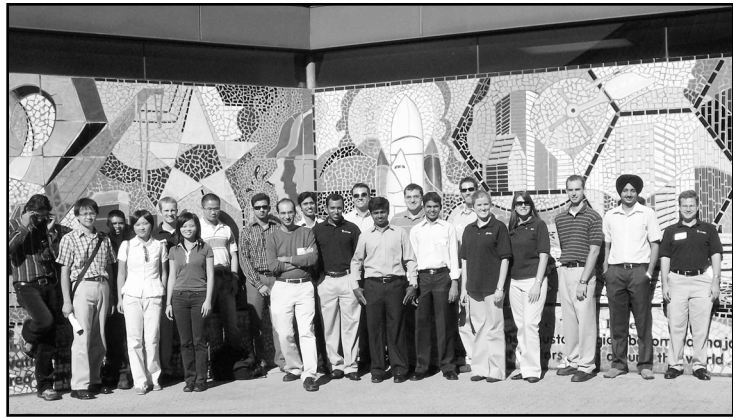
TAMUite Students at Port of Houston