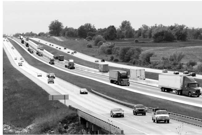
MoDOT Rendering of I-70 TOT Lane

With passenger and commercial vehicle volumes continuing to grow, America's already crowded highway network is becoming increasingly more congested. Since nearly all U.S. freight travels by truck at some point in its supply chain, in a growing worldwide market place, ensuring the continued safe and efficient flow of this freight is vital to maintain the health and competitiveness of the U.S. economy. In many urban areas, traffic levels are reaching critical levels of congestion that must be addressed; according to the Federal Highway Administration, time spent idling on these highways by trucks already costs the U.S. economy nearly $8 billion per year. Particularly in sectors of the trucking industry where delivery time reliability is vital, urban congestion is an important concern.