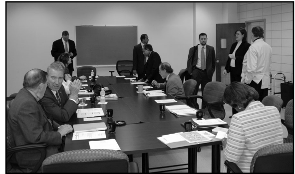
Region 6 UTC Personnel Gather to Discuss Collaborative Opportunities