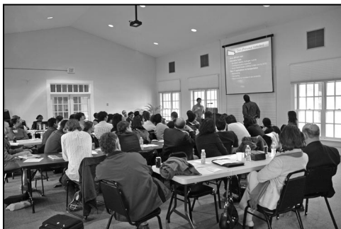
End of the day student presentations

Student evaluations of the conference were very positive with pleas to make it an annual event. "I must say that (the conference) was