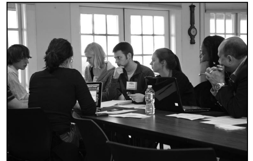
Conference teams at work

Attendance was strong for the event with 52 graduate students participating and 15 faculty and staff members. The day began with welcoming comments from key SWUTC personnel and an icebreaker activity designed to get the students interacting with each other. Next, the students were divided into work teams based on their previously identified area of interest. Each team spent the remainder of the day defining the issues and the actions that would be needed to meet the transportation challenges for their area in the year 2030. Each team prepared a 10 minute presentation at the end of the day summarizing their findings and plans of action. The student groups for this conference consisted