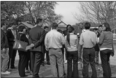
Students and faculty participating in opening icebreaker

How do you get students from rival universities to interact and view each other in a different light? Bring them together for a day of socializing, networking and structured activities in a casual, relaxed setting. And this is exactly what the SWUTC did on March 5th of this year. Graduate transportation students and faculty members from Texas A&M University, Texas Southern University and the University of Texas at Austin were invited to attend a one day student conference held in scenic Winedale, Texas.